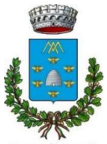
Comune di Ceranesi