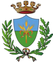
Comune di Campo Ligure